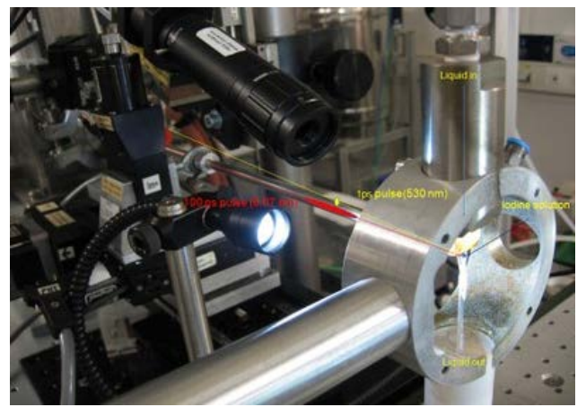
The experimental setup showing schematically the laser and x-ray pulse in space 100 picosecond before they strike the sample. The 100 ps x-ray pulse forms a 30 mm long needle with a 0.3 mm long laser pulse inside it. By varying the relative position of the pulses and using deconvolution algorithms, the distance between the iodine atoms can be measured with 10 ps resolution.

The team found that the I-I bond distance increases from 2.65 Å to a maximum of about 4 Å before the iodine atoms draw back together. The distance differs depending on the solvent: it is greater in cyclohexane than in carbon tetrachloride, which has a higher molecular weight.